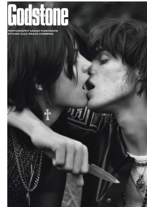
Godstone STYLING: ELISE GRACE GIBBING