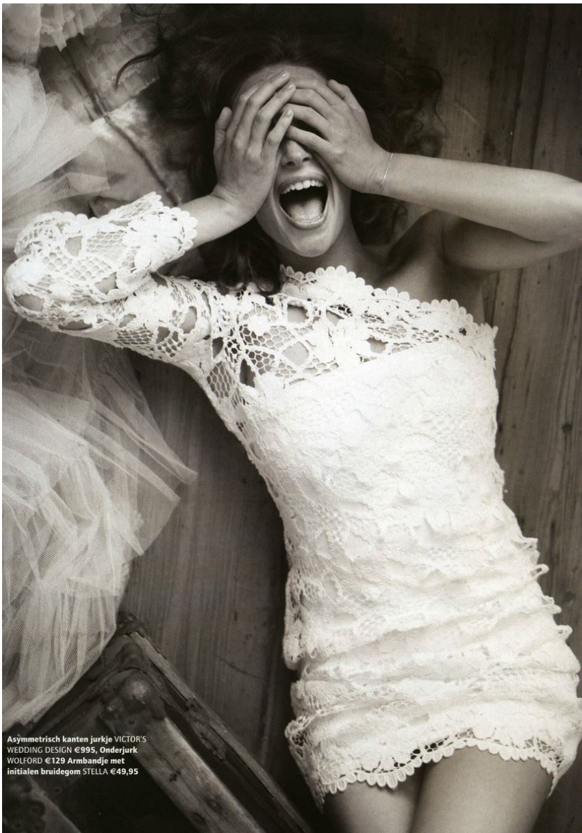
Asymmetrisch kanten jurkje VICTOR'S WEDDING DESIGN €995, Onderjurk WOLFORD €129 Armbandje met initialen bruidegom STELLA €49,95