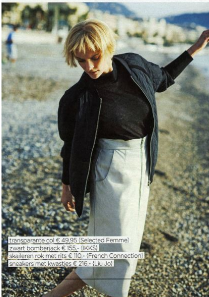
transparante col € 49,95 (Selected Femme) zwart bomberjack € 155,- (IKKS) skaileren rok met rits € 110,- (French Connection) sneakers met kwasties € 216,- (Liu Jo)