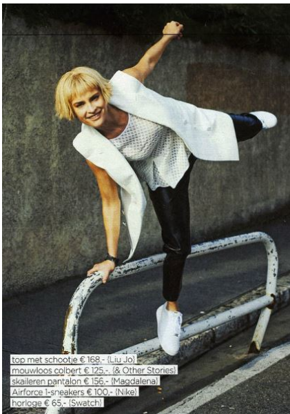
top met schoote € 168,- (Liu Jo) mouwloos colbert € 125,- (& Other Stories) skaileren pantalon € 156,- (Magdalena) Airforce 1-sneakers € 100,- (Nike) horloge € 65,- (Swatch)