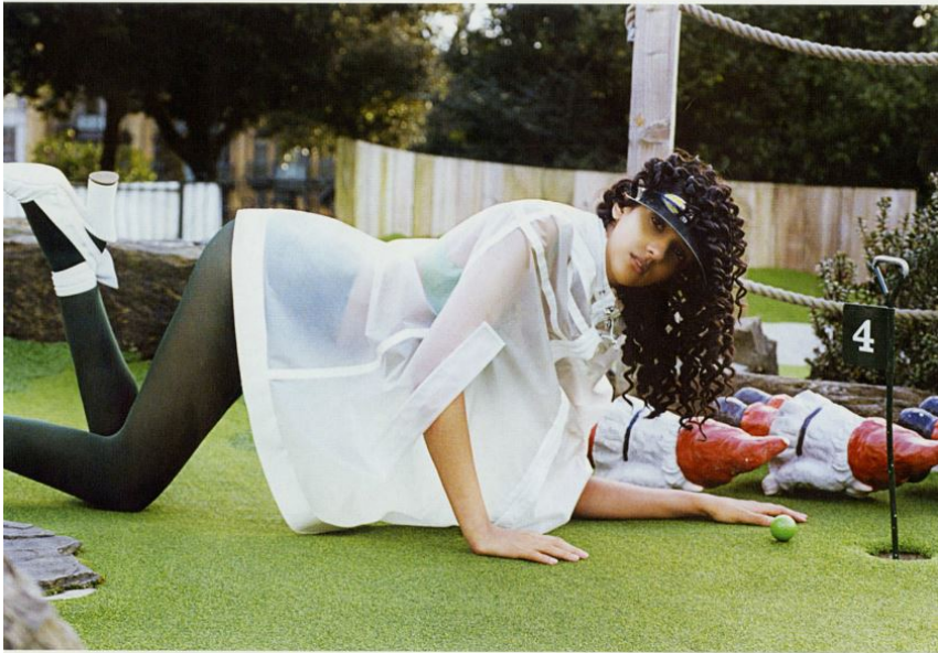
transparent plastic cape by IONCLER, green lace bra and teen nylon tights by TOPSHOP and white heeled slingback shoes by CHRISTIAN DIOR