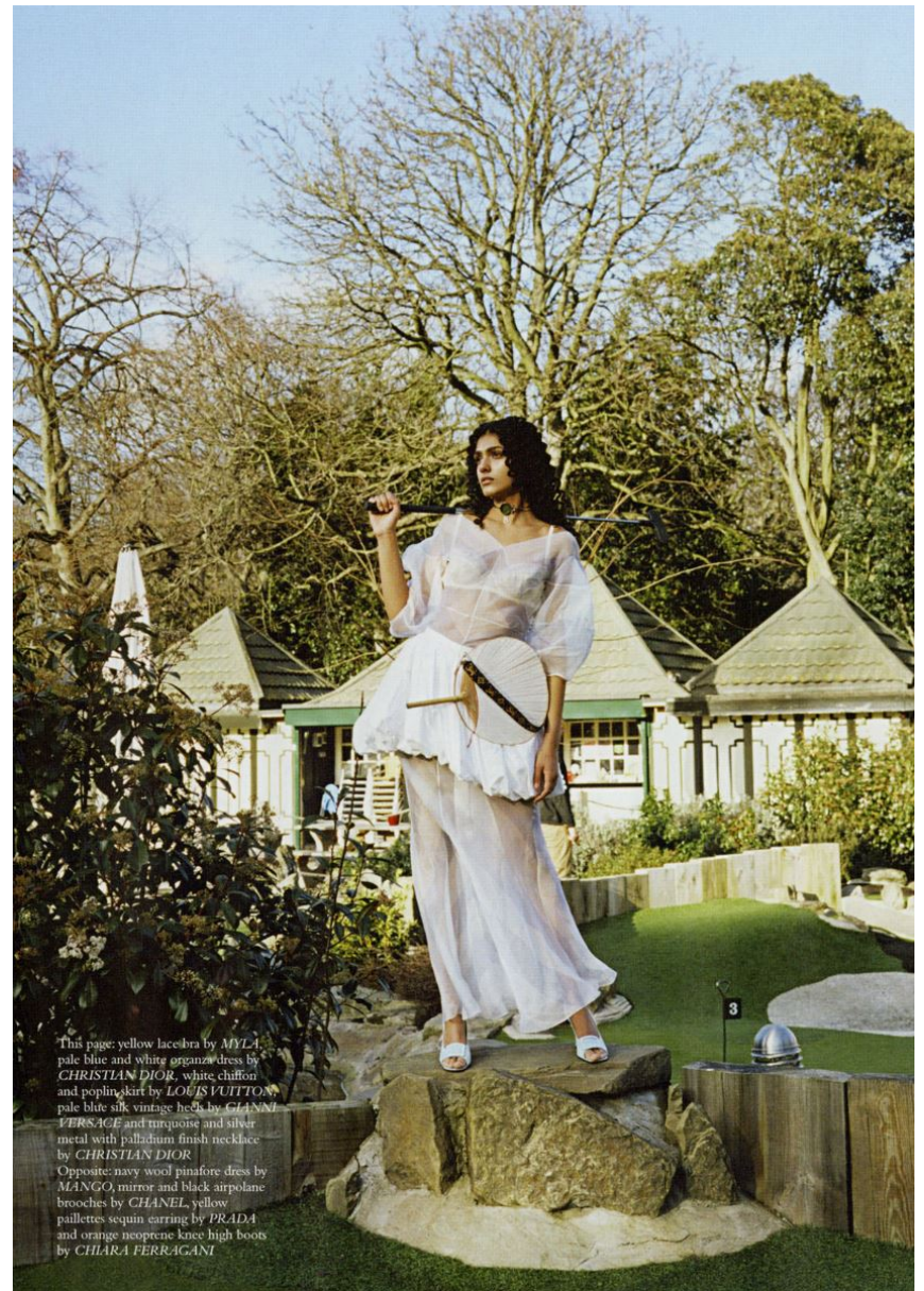
This page: yellow lacebra by MYLA, pale blue and white organza dress by CHRISTIAN DIOR, white chiffon and poplin skirt by LOUIS VUITTON, pale blue silk vintage heels by GIANNI VERSACE and turquoise and silver metal with palladium finish necklace by CHRISTIAN DIOR Opposite: navy wool pinafore dress by MANGO, mirror and black airpolane brooches by CHANEL, yellow paillettes sequin earring by PRADA and orange neoprene knee high boots by CHIARA FERRAGANI