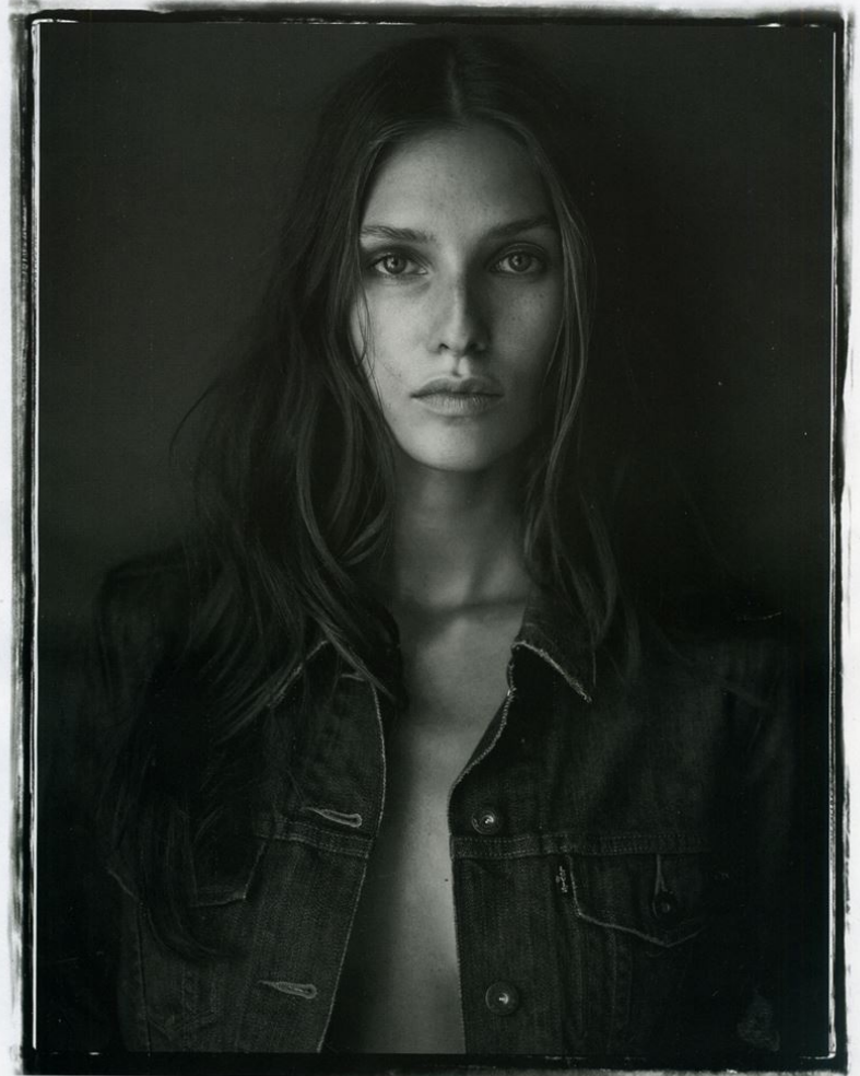
Giubbotto classico in denim, Levi's.