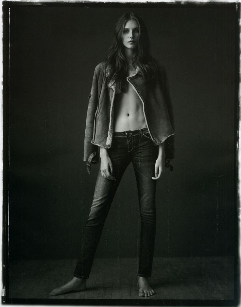
Chiodo in shearling, Diesel Black Gold. Jeans skinny con bottone gioiello, KoCCA.