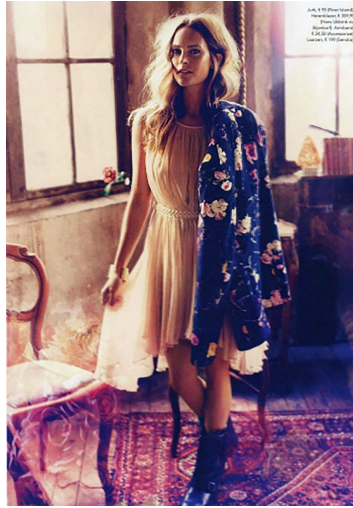
July, 4 195 (Dress: Louis Vuitton, Jacket: Prada, Shoes: Altuzarra, Accessories: Dior, Ring: Cartier, London, 4 195 (Dress: Louis Vuitton, Jacket: Prada, Shoes: Altuzarra, Accessories: Dior, Ring: Cartier)