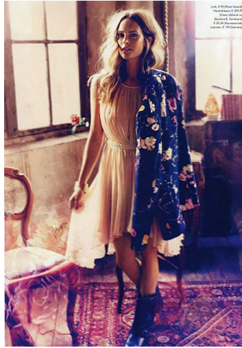
July, 4 195 (Dress: Louis Vuitton, Jacket: Prada, Shoes: Altuzarra, Accessories: Dior, Jewelry: Cartier, London, 4 195 (Dress: Louis Vuitton, Jacket: Prada, Shoes: Altuzarra, Accessories: Dior, Jewelry: Cartier)