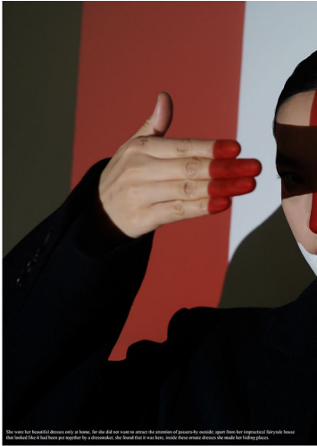
She wears her beautiful dresses only at home. For this she can wear the costumes of people by mistake, wear them for unexpected days like here. But behind this it has been put together by a dreamer... she found that it was here, inside these areas where she made her living place.