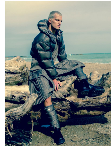
DRY A -> Abstrak short sleeve shirt, plaided skirt, long sleeve hooded jacket, leather combat boots, boots